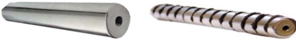
Illustration for Liquid

PMT Rod/Tube Magnet are made up of " Gemini Rare Earth Powerful Magnets " encased in stainless steel 304. They are very useful where due to space restrictions Magnet Grill or Drawer in-housing arrangement is not possible. Magnet Rods are widely used for removing fine iron particles from free flowing products such as flour, tea, coffee, grain, chemicals, pharmaceuticals, plastic powder, guar gum powder, sugar, granulate and any other types of powder. Magnet Rods/Tubes are available in standard size with diameter of 1" and length as per the end user requirement. Magnet Rods/Tubes are available with threading on both sides/single side or blank or with studded ends for easy and appropriate installation in hopper, pipelines etc.